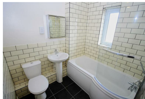
** TWO BED APARTMENT *** FIRST FLOOR ** uPVC DOUBLE GLAZING *** ALLOCATED PARKING **

Two bedroom first floor apartment located in the Eastbourne area on a modern development just off Hundens Lane, within easy reach of local amenities and schooling. Both Darlington town centre and the railway station can be found within close proximity along with convenient transport links to both the A1(M) and A66.